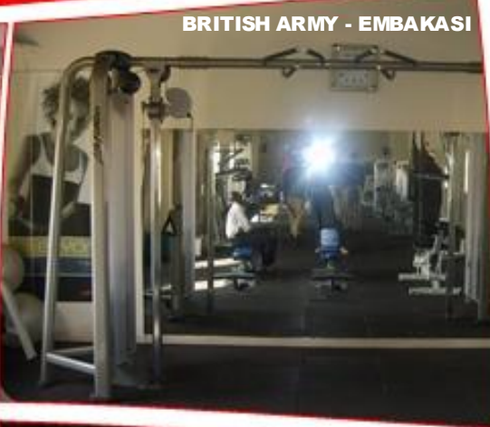
BRITISH ARMY - EMBAKASI