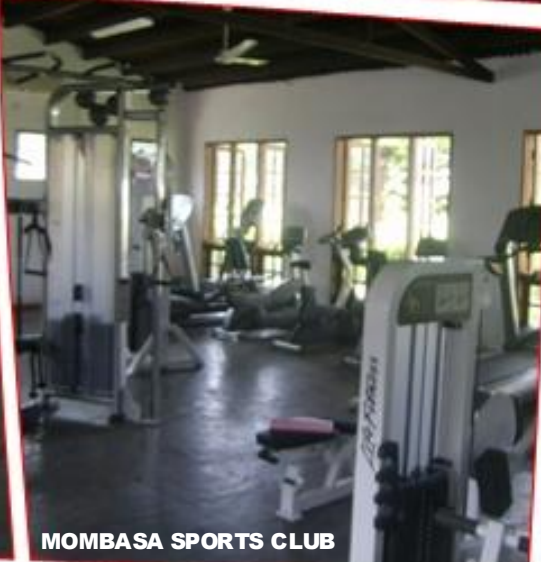
MOMBASA SPORTS CLUB