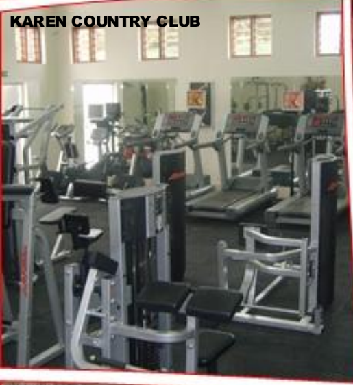
KAREN COUNTRY CLUB