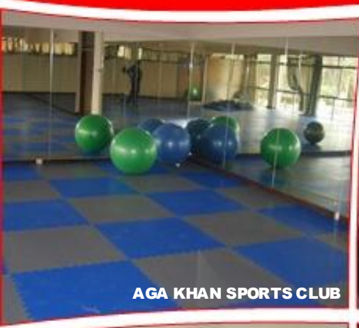
AGA KHAN SPORTS CLUB