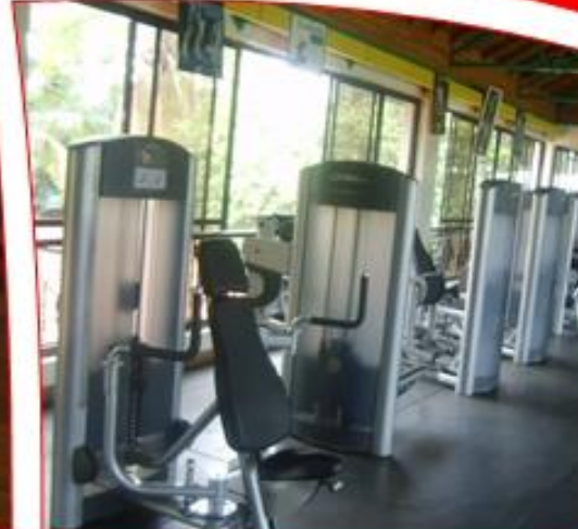
PARKLANDS SPORTS CLUB