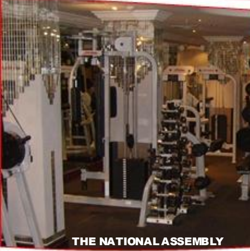
THE NATIONAL ASSEMBLY